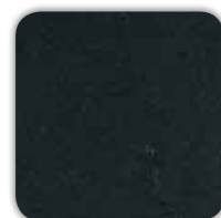
B = Nero Italiano B = Italian Black