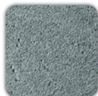
A = Argento Antico A = Antique Silver