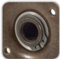
Sistema antisfilamento Blocking system