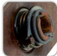
Molla di ritorno Patented spring