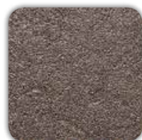
R = Ruggine R = Rust