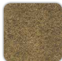
O = Oro Antico O = Antique Gold