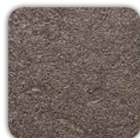
R = Ruggine R = Rust